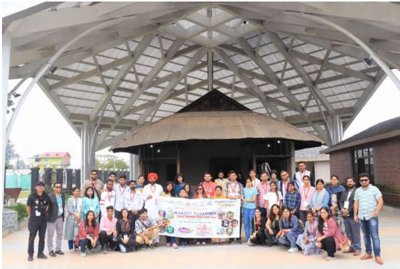
Visit to INA Headquarter

On the fifth day, participants from Punjab visited INA Headquarter and INA Museum. They also visited Sangai Ethnic Park. The beautiful Loktak Lake was visited by the team. They went for boating in Loktak Lake. They took their lunch at Moirang. After taking their meal, they proceeded to Stadium to watch and witness Hero Tri-National International Football Tournament between Krygz and India. The tickets were sponsored by the Honourable Chief Minister of Manipur. After returning back to university campus, they enjoyed Manipuri Traditional Thali in dinner at the University Canteen.