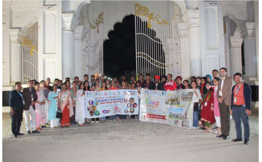
Visit to Govindji Temple