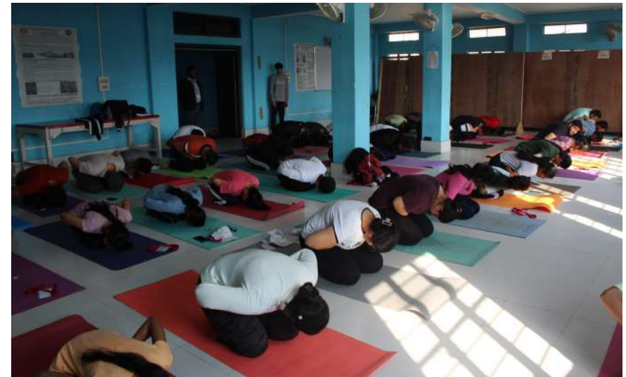
Yoga Session in the Yoga Lab of Department of PESS, Manipur University