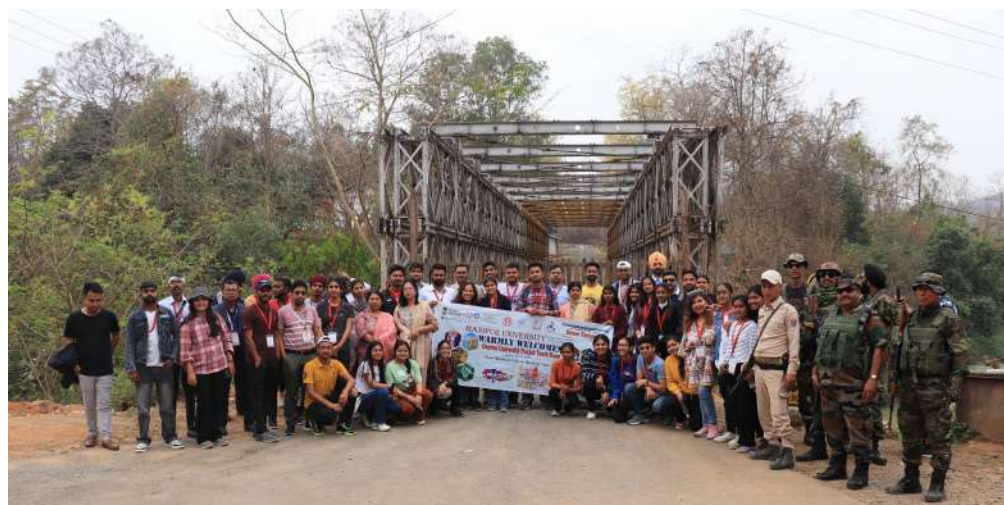
Visit to India-Myanmar border, Moreh