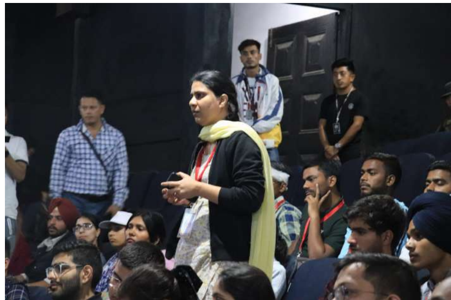
Interaction with Padmashri Ratan Thiyam