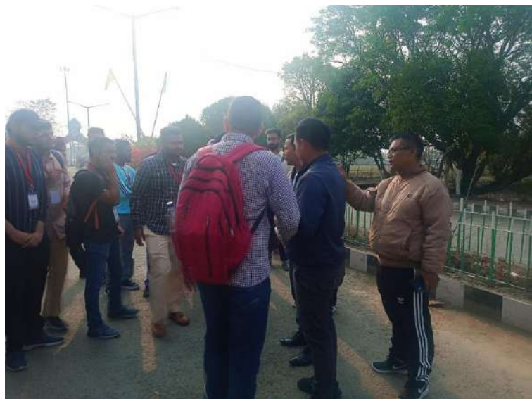
Pairing the delegates with local students for Buddy Programme