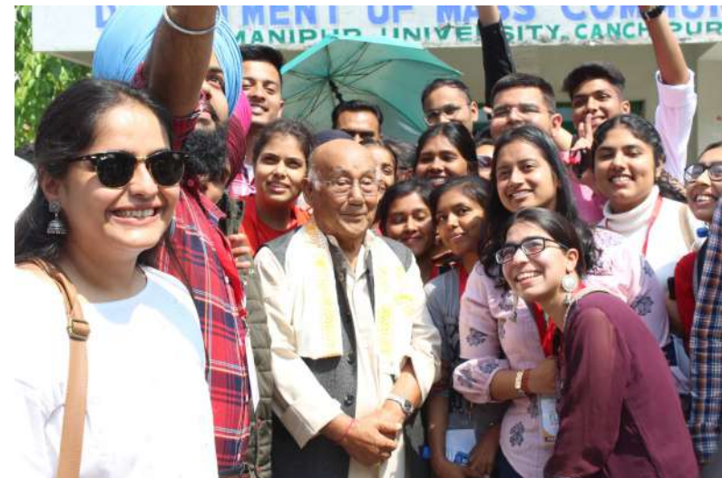
Screening of Documentary "Yelhou Jagoi" and Interaction with Padmashri Aribam Shyam Sharma, Filmmaker