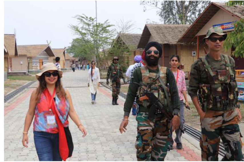
Visit to Sangai Ethnic Park