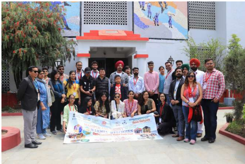
Visit to INA Museum

On the fifth day, participants from Punjab visited INA Headquarter and INA Museum. They also visited Sangai Ethnic Park. The beautiful Loktak Lake was visited by the team. They went for boating in Loktak Lake. They took their lunch at Moirang. After taking their meal, they proceeded to Stadium to watch and witness Hero Tri-National International Football Tournament between Krygz and India. The tickets were sponsored by the Honourable Chief Minister of Manipur. After returning back to university campus, they enjoyed Manipuri Traditional Thali in dinner at the University Canteen.