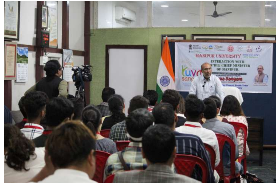
Interaction with Honourable Chief Minister of Manipur