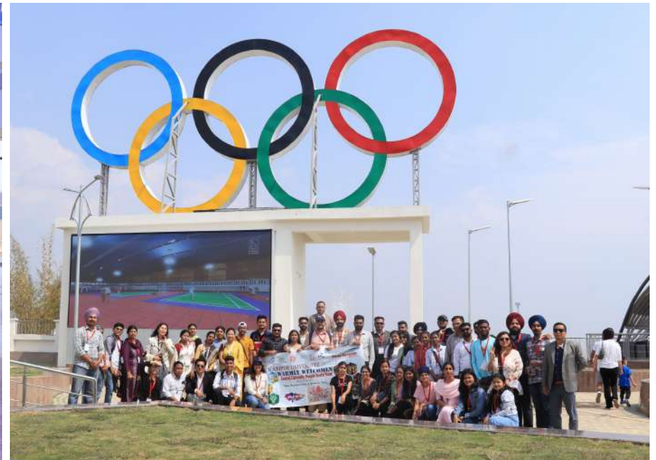
Visit to Olympian Park at Sangaitel