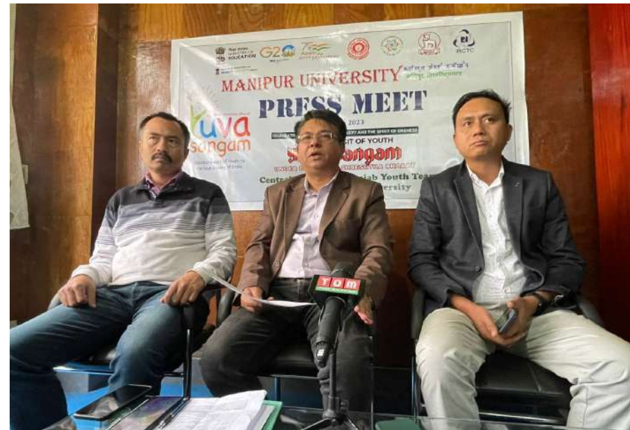
Dean Students Welfare, Nodal Officer and Public Relation Officer, MU briefing the media