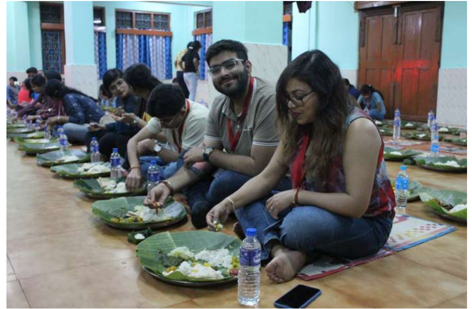
Manipuri Traditional Dinner at University Canteen