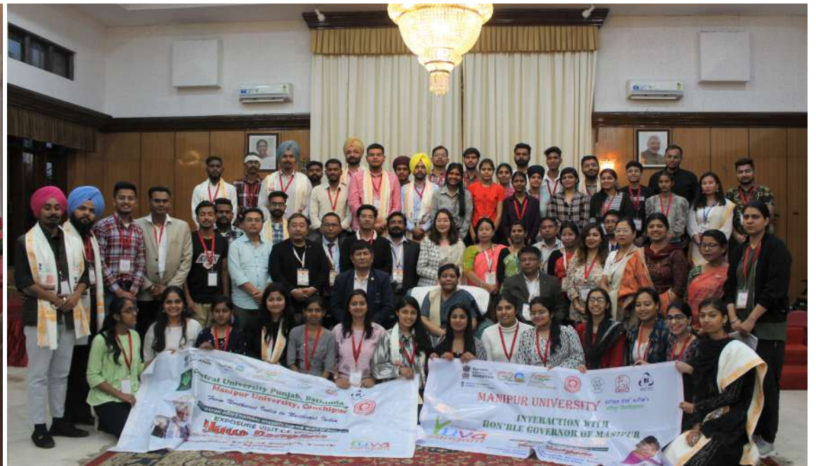
Interaction with Honourable Governor of Manipur at Raj Bhavan Manipur