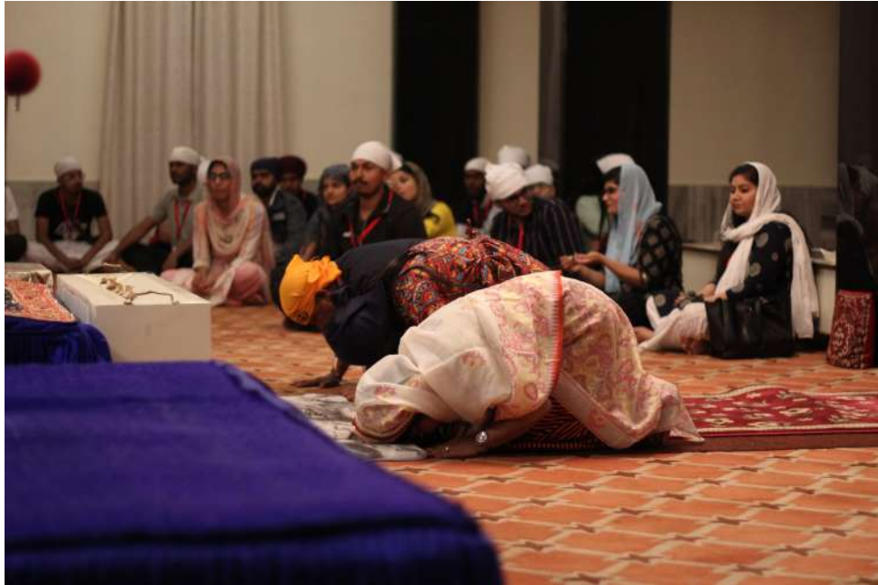
Visit to Gurudwara Sri Guru Singh Sabha, Imphal