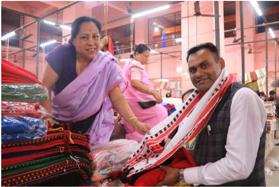
Visit to Ima Market