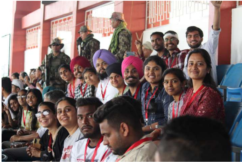
Witnessing Hero Tri-Nation International Football Tournament between Krygz vs India