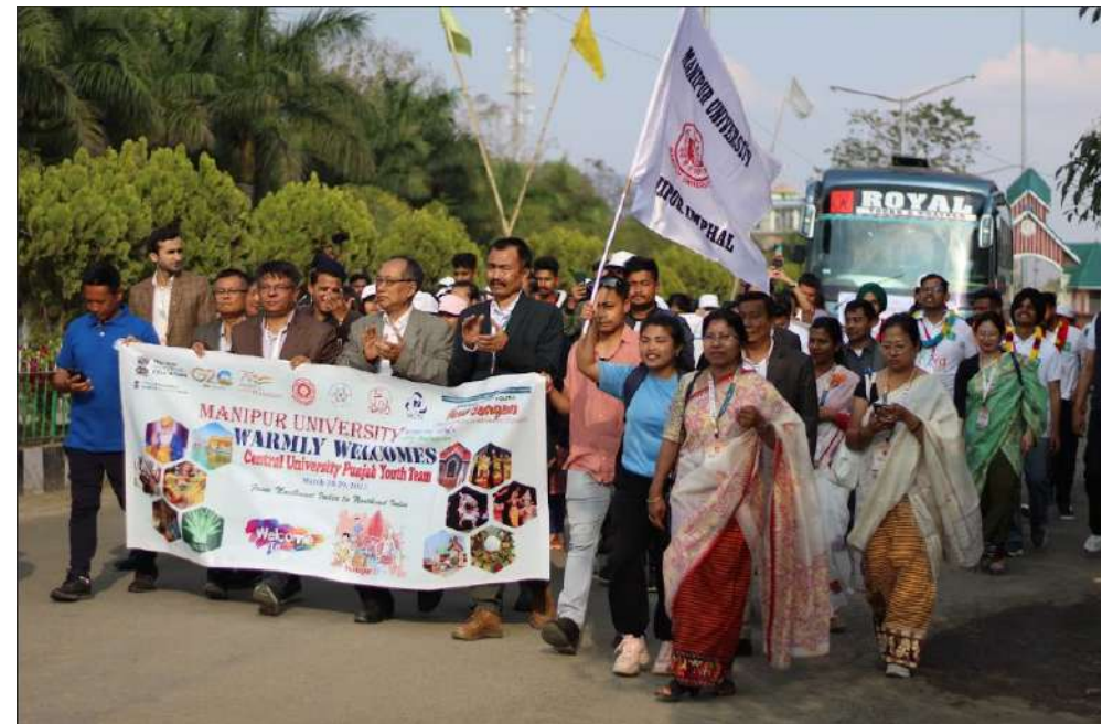
Grand Welcome at Imphal Airport Grand Reception at Manipur University