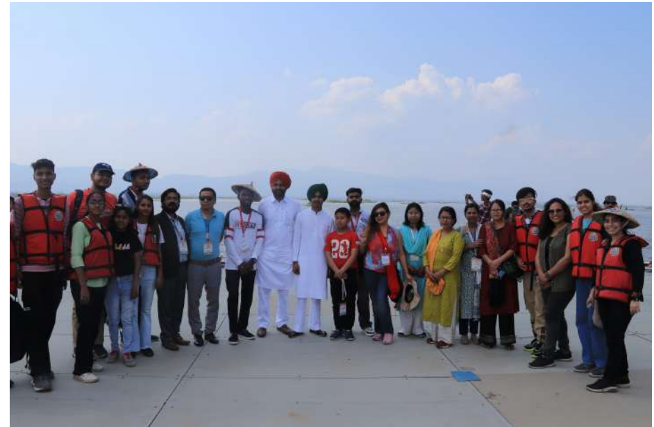
Visit to Loktak Lake