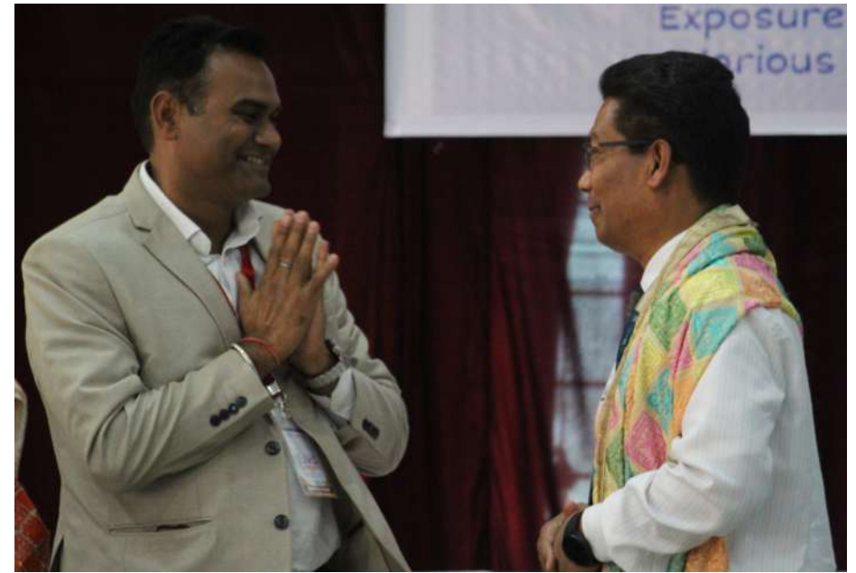
Formal Reception Ceremony of Punjab Team at University Court Hall