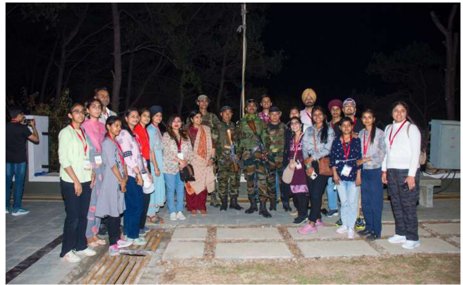
Visit to Marjing Complex