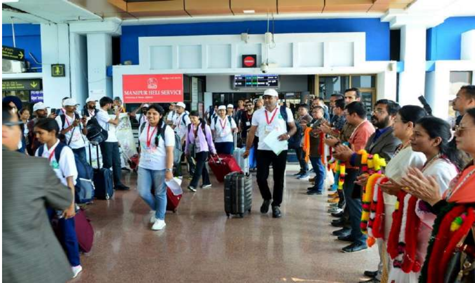
Arrival at Imphal Airport