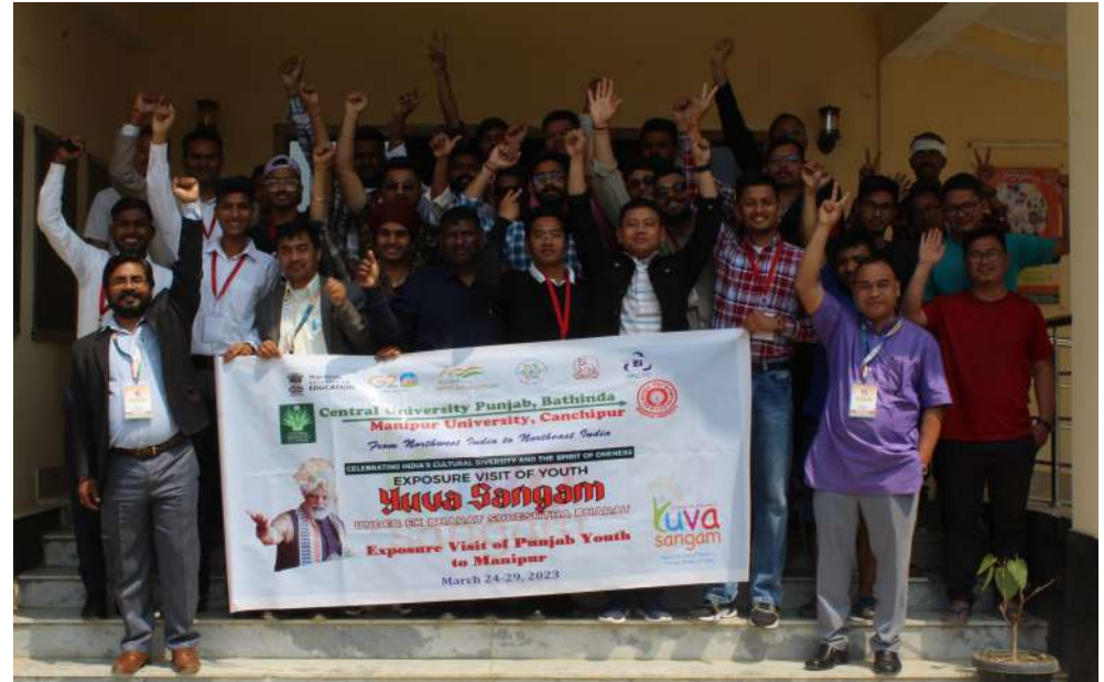
Visiting University Hostel