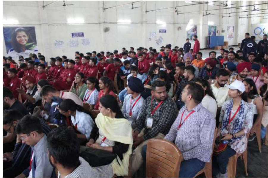
Visit to Khuman Lampak and National Sports University, Imphal