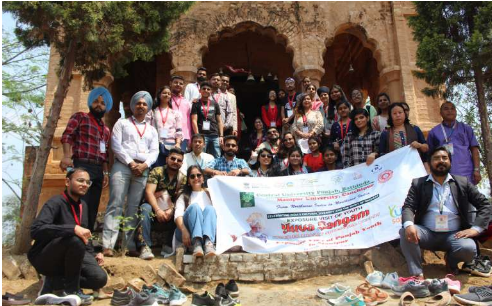
Visiting Heritage site inside the campus and University Museum