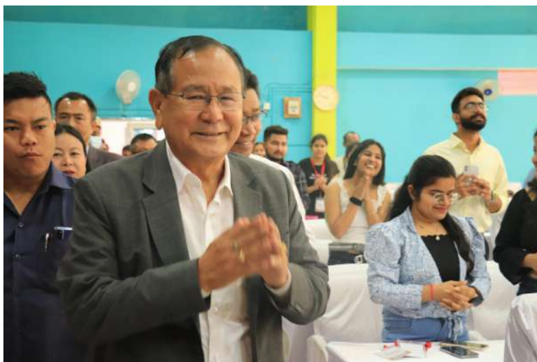
Interaction with Dr. R. K. Ranjan, Honourable Union Minister of State for Education and External Affairs at University Court Hall